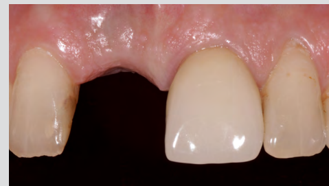
Baseline frontal view: missing central incisor. Implant visible through mucosa due to thin biotype.