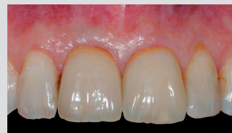
6 month follow-up: final crown in place.

“Avoiding a second surgical site reduces patient morbidity as well as my surgical time.”